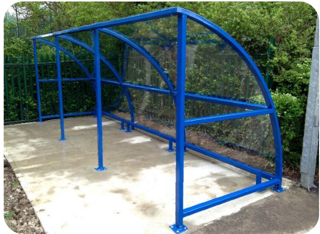
Above: After Shelter Installation Princes Plain Clinic