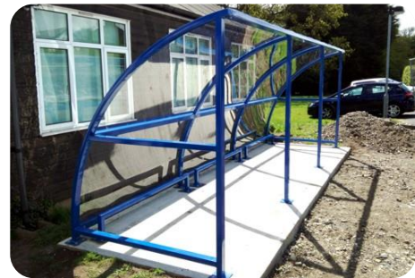
Above: Buggy Shelter Installed at Willows Clinic

The Easydale Buggy Shelter was chosen by Ashley House as the ideal product for both clinics. The Easydale Shelter is a cost effective shelter that can provide cover to bicycles and buggies and can also be used as a waiting shelter depending on whether you choose to have buggy bars, cycle racks or benches installed.