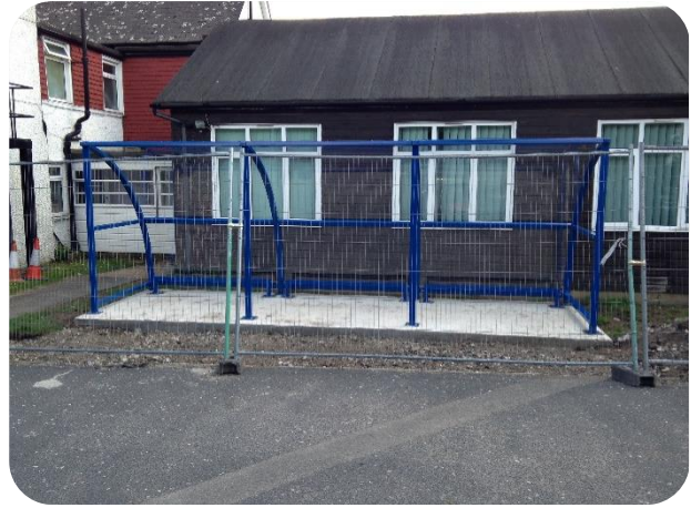
Above: After Shelter Installation Willows Clinic