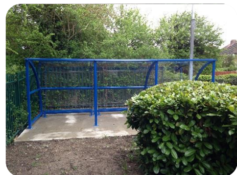
Above: Buggy Shelter Installed at Princes Plain Clinic

We installed the buggy shelter at Princes Plain Clinic on Wednesday 8 th May 2013 and then installed the buggy shelter at Willows Clinic on the following day, Thursday 9 th May 2013.