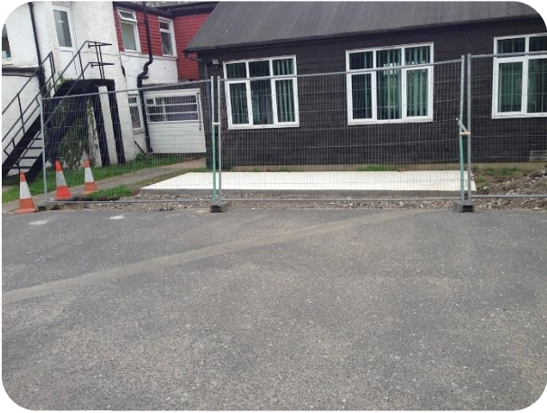
Above: Before Shelter Installation at Willows Clinic