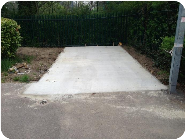
Above: Before Shelter Installation at Princes Plain Clinic